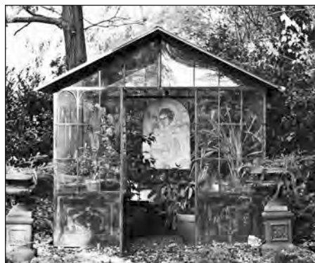
Yost Garden House

Gardeners love visiting the Personal Edens of other gardeners. They provide insight into the style of the gardener, as well as